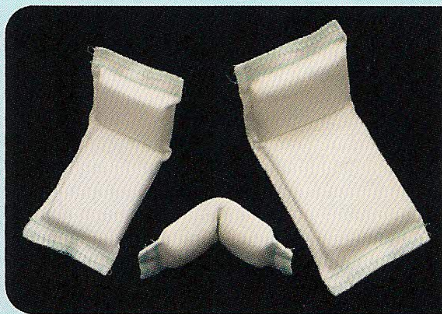
5 Sizes of bendable TarryBoards